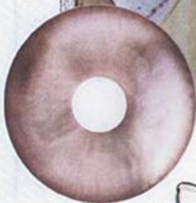
'Parabola' copper floor lamp, Atelier Biogeni

Work the trend: You can place a single piece in a vintage room with busy prints. Or you can place a contemporary metallic piece in a colonial setting and have it contrast with the wood." ●