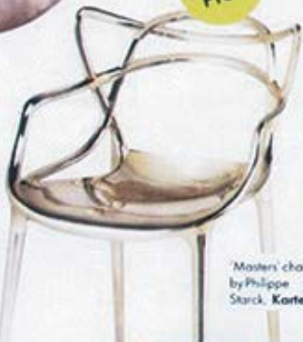
'Masters' chair by Philippe Starck, Kartell