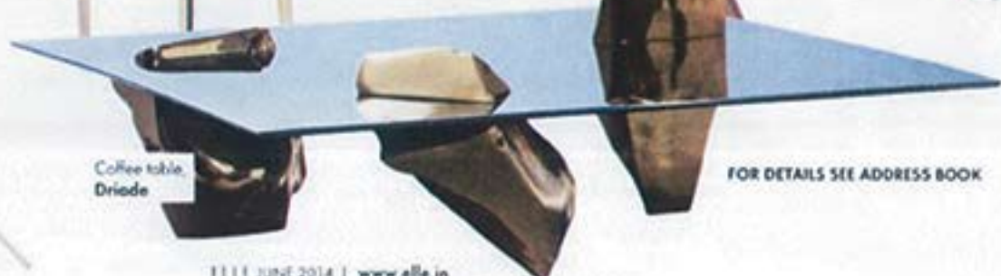
Coffee table, Triade , Driade