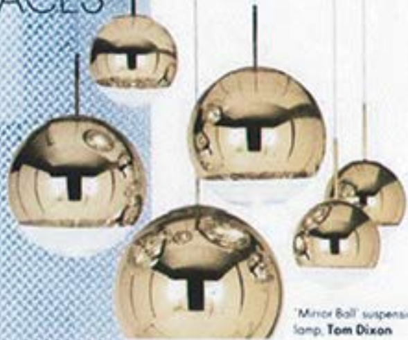
'Mirror Ball' suspension lamp, Tom Dixon