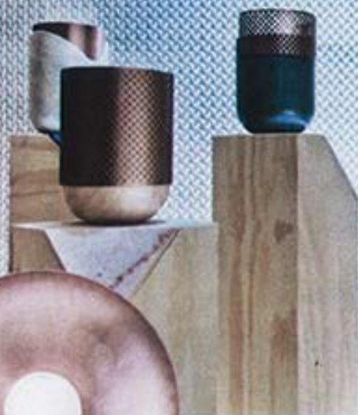
'RABBIT' VASE BY PATRICIA UROQUIOLA FOR BUDRI

"Metallics are a trend for all seasons. But it's interesting to see new interpretations: the Triade coffee table uses it subtly to create a point of interest as opposed to the more generous application in Knoll's chair.